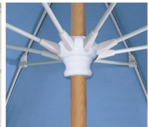
Detail of 8 Rib Hub