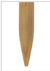
Pole End Tip