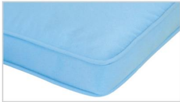
BOX with DOUBLE WELT

FiberBuilt manufactures all sizes, shapes and styles of replacement cushions, seat pads and decorative pillows to refresh the look of existing chaise lounges, dining chairs, deep seating and benches. Choose from Box with Double Welt, Bullnose and Knife Edge styles.