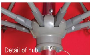
Detail of hub

All Prestige Collection Aluminum umbrellas feature: