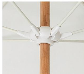
Detail of 6 Rib Hub