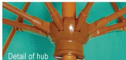
Detail of hub