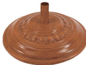
Original Egg & Dart Style

FIBERGLASS in 6 sizes and 8 colors, with or without wheels