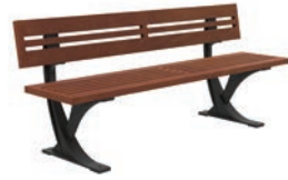
MLB1200 SERIES ENDS: CAST ALUMINUM SEAT: IPE OR HDPC

OPTIONS: SIDE ARMS, PLAQUE, SKATE DETERRENT