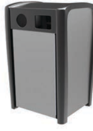
MRC1402 SERIES CAST ALUMINUM FRAME, STEEL, HDPE PLASTIC OR HDPC PANELS 2 X 23 GALLONS LINER: HEAVY DUTY PLASTIC LID: STAINLESS STEEL

OPTIONS: FACE PLATE COLOR (GREEN OR BLACK), VINYL GRAPHICS, LABELS