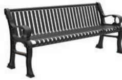
MLB310 SERIES ENDS: CAST ALUMINUM SEAT: IPE, STEEL FLAT BAR OR HDPE PLASTIC

OPTIONS: CENTER ARM, PLAQUE, SKATE DETERRENT