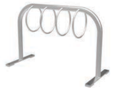
MBR300 SERIES H.S. STEEL TUBE, SOLID STEEL ROD OPTIONS: 4, 5 OR 7 RINGS, SURFACE MOUNT, DIRECT BURIAL, GALVANIZED FINISH