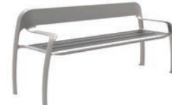
SCB1600 SERIES ENDS: CAST ALUMINUM SEAT: IPE OR HDPC