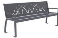
MLB970 SERIES ENDS: CAST ALUMINUM SEAT: IPE, LASERED STEEL PANELS OR HDPC

OPTIONS: CENTER ARM, PLAQUE, SKATE DETERRENT