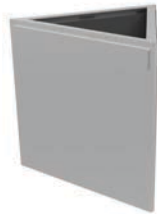
LXM1500-TM SERIES STEEL LINER: GALVANIZED STEEL OPTIONS: LASER CUT OR PERFORATED STEEL TOP, END CAP, LEXICON COMPONENTS