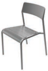
FRC1700-MSF SERIES FRAME: STEEL TUBE SEAT: LASER FORMED STEEL BACK: ALUMINUM CASTING