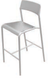
FRST1700-MSF-BH SERIES FRAME: STEEL TUBE SEAT: LASER FORMED STEEL BACK: ALUMINUM CASTING

OPTIONS: NARROW BAR HEIGHT TABLE (3 SLATS)