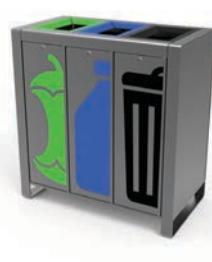
LXRC1503-48 SERIES STEEL FRAME, LASER CUT AND FORMED STEEL PANELS 3 X 16 GALLONS LINER: HEAVY DUTY PLASTIC LID: METAL

OPTIONS: RAIN SHIELD, VINYL GRAPHICS, LABELS, LID COLORS