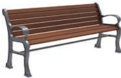
MLB300 SERIES ENDS: CAST ALUMINUM SEAT: IPE, STEEL FLAT BAR OR HDPE PLASTIC

OPTIONS: CENTER ARM, PLAQUE, SKATE DETERRENT