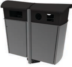
SCRC1603 SERIES FORMED STEEL FRAME, CAST ALUMINUM SUPPORT 1 X 32 GALLON & 2 X 16 GALLONS LINER: HEAVY DUTY PLASTIC LID: MOLDED PLASTIC