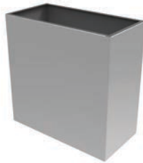
MLP1500-MPR-R3 SERIES FORMED STEEL LINER: POLYURETHANE WATERPROOF COATING