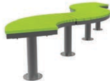
OGM1900-00030 ENDS: STEEL SEAT: IPE, HDPE PLASTIC OR HDPC

OPTIONS: VARIOUS RADII, MOUNTING, ARMS, SKATE DETERRENTS