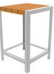
MLTB1050-BHSQ SERIES FRAME: FORMED STEEL TABLE TOP: IPE, HDPE PLASTIC OR HDPC