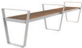
LXM1500-00039 ENDS: STEEL SEAT: IPE, PERFORATED STEEL, HDPE PLASTIC OR HDPC

OPTIONS: BACKED, VARIOUS LEG STYLES, PLANTER MODULES