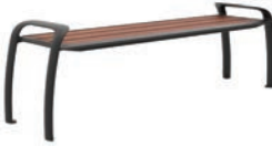
SCB1600B SERIES ENDS: CAST ALUMINUM SEAT: IPE OR HDPC