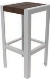
MLST1050B-BH SERIES FRAME: FORMED STEEL SEAT: IPE, HDPE PLASTIC OR HDPC

OPTIONS: LASER PATTERN, 30" OR 36" SIZE, FREE STANDING, SURFACE MOUNT, DIRECT BURIAL, UMBRELLA MOUNT