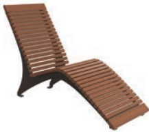
MCL720 SERIES FRAME: STEEL SEAT: IPE OR STEEL SLATS