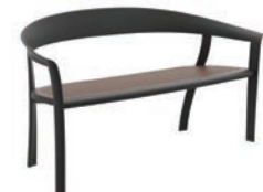
MLB1400 SERIES ENDS: CAST ALUMINUM SEAT: HDPE PLASTIC OR HDPC