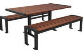
MLPT720 SERIES FRAME: SOLID CAST ALUMINUM, H.S. STEEL TUBE AND FLAT BAR TABLE TOP & SEATS: IPE

OPTIONS: SURFACE MOUNT, DIRECT BURIAL, WHEELCHAIR ACCESSIBILITY, GAME BOARD