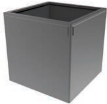
LXM1500-SM SERIES STEEL LINER: GALVANIZED STEEL OPTIONS: LASER CUT OR PERFORATED STEEL TOP, END CAP, LEXICON COMPONENTS