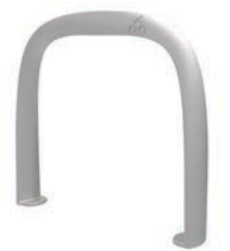
SCBR1600 SERIES CAST ALUMINUM OPTIONS: SURFACE MOUNT, DIRECT BURIAL