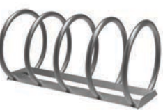
MBR350 SERIES H.S. STEEL TUBE, FORMED STEEL, SOLID STEEL ANGLE OPTIONS: 4 OR 5 LOOPS