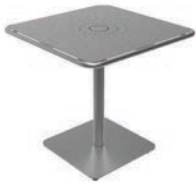
FRT1700-SQ SERIES BASE: STEEL PLATE AND TUBE TABLE TOP: LASER CUT STEEL AND STEEL TUBE OUTER RING

OPTIONS: LASER PATTERN, 30" OR 36" SIZE, FREE STANDING, SURFACE MOUNT, DIRECT BURIAL, UMBRELLA MOUNT