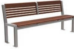
MLB720 SERIES ENDS: CAST ALUMINUM, H.S. STEEL SUPPORT BARS SEAT: IPE

OPTIONS: CENTER ARM, PLAQUE, SKATE DETERRENT