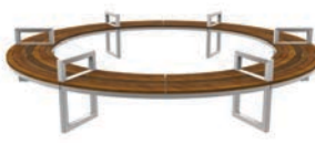
OGM1900-00020 ENDS: STEEL SEAT: IPE, HDPE PLASTIC OR HDPC

OPTIONS: VARIOUS RADII, MOUNTING, ARMS, SKATE DETERRENTS