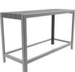
MLTB1050-BH SERIES FRAME: FORMED STEEL TABLE TOP: IPE, HDPE PLASTIC OR HDPC

OPTIONS: NARROW BAR HEIGHT TABLE (3 SLATS)