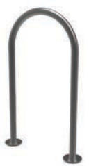
MBR500 SERIES H.S. STEEL TUBE OPTIONS: SURFACE MOUNT, DIRECT BURIAL, GALVANIZED FINISH