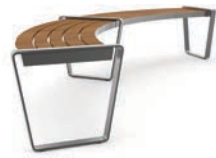
LXM1500-00006 ENDS: STEEL SEAT: IPE, PERFORATED STEEL, HDPE PLASTIC OR HDPC

OPTIONS: BACKED, VARIOUS LEG STYLES, PLANTER MODULES