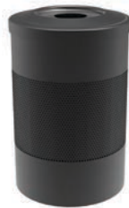
MLWR600-32 SERIES STAMPED PERFORATED PATTERN 32 GALLON LINER: HEAVY DUTY PLASTIC LID: SPUN METAL