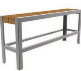
MLB1050B-BH SERIES FRAME: FORMED STEEL SEAT: IPE, HDPE PLASTIC OR HDPC