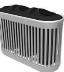
MRC253 SERIES STEEL FLAT BAR 3 X 20 GALLONS LINER: HEAVY DUTY PLASTIC LID: BLACK MOLDED ABS