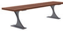
MLB1200B SERIES ENDS: CAST ALUMINUM SEAT: IPE OR HDPC