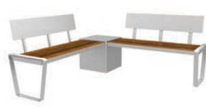
LXM1500-00046 ENDS: STEEL SEAT: IPE, PERFORATED STEEL, HDPE PLASTIC OR HDPC

OPTIONS: BACKED, VARIOUS LEG STYLES, PLANTER MODULES