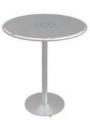
FRT1700-RD-BH SERIES BASE: STEEL PLATE AND TUBE TABLE TOP: LASER CUT STEEL AND STEEL TUBE OUTER RING

OPTIONS: LASER PATTERN, 30" OR 36" SIZE, FREESTANDING, SURFACE MOUNT, DIRECT BURIAL, FOOTREST RING