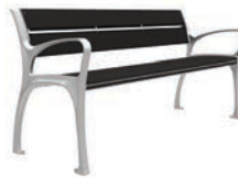
MLB870 SERIES ENDS: CAST ALUMINUM SEAT: IPE, LASERED STEEL PANELS OR HDPC

OPTIONS: CENTER ARM, PLAQUE, SKATE DETERRENT