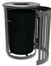
MLWR250S-32 SERIES H.S. STEEL TUBE AND FLAT BAR 32 GALLON LINER: HEAVY DUTY PLASTIC LID: SPUN METAL