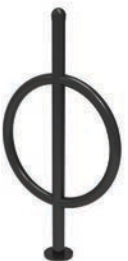
MBR100 SERIES H.S. STEEL TUBE, ALUMINUM TOP CASTING

OPTIONS: SURFACE MOUNT, DIRECT BURIAL, GALVANIZED FINISH