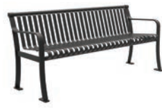
MLB510 SERIES H.S. STEEL TUBE AND FLAT BAR OPTIONS: CENTER ARM, PLAQUE

OPTIONS: LASER DESIGN, CENTER ARM, PLAQUE