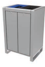
LXRC1502-32 SERIES STEEL FRAME, LASER CUT AND FORMED STEEL PANELS 2 X 16 GALLONS LINER: HEAVY DUTY PLASTIC LID: METAL

OPTIONS: RAIN SHIELD, VINYL GRAPHICS, LABELS, LID COLOR