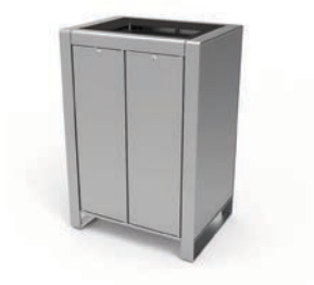
LXRC1500-32 SERIES STEEL FRAME, LASER CUT AND FORMED STEEL PANELS 32 GALLON LINER: HEAVY DUTY PLASTIC LID: METAL

OPTIONS: RAIN SHIELD, VINYL GRAPHICS, LABELS, LID COLOR