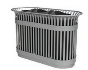
MRC203 SERIES STEEL FLAT BAR 3 X 20 GALLONS LINER: HEAVY DUTY PLASTIC LID: BLACK MOLDED ABS