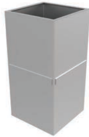
LXM1500-MPS-S2 SERIES FORMED STEEL LINER: GALVANIZED STEEL OPTIONS: END CAP, LEXICON COMPONENTS