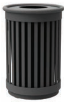
MLWR250-32 SERIES H.S. STEEL TUBE AND FLAT BAR 32 GALLON LINER: HEAVY DUTY PLASTIC LID: SPUN METAL

OPTIONS: SIDE OPENING, DOME LID, SIDE ASH RECEPTACLE