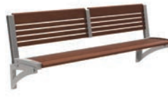
MLB720CL SERIES ENDS: CAST ALUMINUM, H.S. STEEL SUPPORT BARS SEAT: IPE