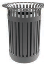
MLWR200-32 SERIES STEEL FLAT BAR 32 GALLON LINER: HEAVY DUTY PLASTIC LID: SPUN METAL

OPTIONS: SIDE OPENING, DOME LID, SIDE ASH RECEPTACLE