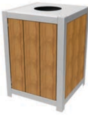
MLWR1050 SERIES FORMED STEEL FRAME, IPE, HDPE PLASTIC OR HDPC SIDES LINER: LLDPE PLASTIC LID: METAL

OPTIONS: FACE PLATE COLOR (GREEN OR BLACK), VINYL GRAPHICS, LABELS