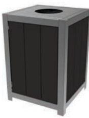
MLWR1050-PC SERIES FORMED STEEL FRAME, HDPC SIDES LINER: LLDPE PLASTIC LID: METAL