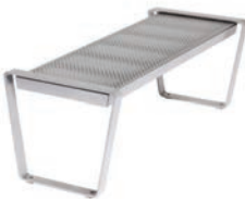
LXM1500-00050 ENDS: STEEL SEAT: IPE, PERFORATED STEEL, HDPE PLASTIC OR HDPC

Use an array of easy-to-assemble geometric shapes to create your own curves and angles. Mix and match styles, surface materials, colors and accessories.