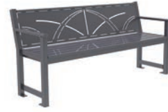
MLB400 SERIES ENDS: H.S. STEEL TUBE AND FLAT BAR SEAT: IPE, LASERED STEEL PANELS, HDPE PLASTIC OR HDPC

OPTIONS: CENTER ARM, PLAQUE, SKATE DETERRENT