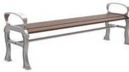
MLB300B SERIES ENDS: CAST ALUMINUM SEAT: IPE, STEEL FLAT BAR OR HDPE PLASTIC

OPTIONS: CENTER ARM, PLAQUE, SKATE DETERRENT