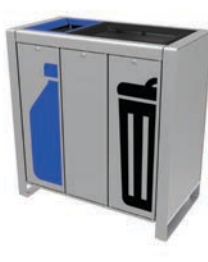
LXRC1502-48 SERIES STEEL FRAME, LASER CUT AND FORMED STEEL PANELS 1 X 16 GALLON & 1 X 32 GALLON LINER: HEAVY DUTY PLASTIC LID: METAL

OPTIONS: RAIN SHIELD, VINYL GRAPHICS, LABELS, LID COLORS