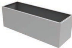
MLP1500-MPR-R4 SERIES FORMED STEEL LINER: POLYURETHANE WATERPROOF COATING