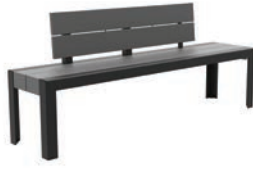
MLB1050 SERIES ENDS: FORMED STEEL SEAT: IPE, HDPE PLASTIC OR HDPC