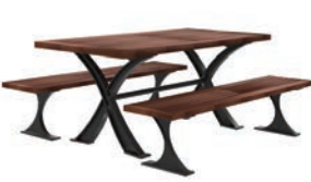
MLPT1200 SERIES FRAME: CAST ALUMINUM TABLE TOP & SEATS: IPE

OPTIONS: BACKED, WHEELCHAIR ACCESSIBILITY, GAME BOARD, UMBRELLA MOUNT