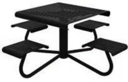
MLPT1100B SERIES FRAME: H.S. STEEL TUBE TABLE TOP & SEATS: IPE, LASERED STEEL PANELS OR HDPC

OPTIONS: BACKED, WHEELCHAIR ACCESSIBILITY, GAME BOARD, UMBRELLA MOUNT