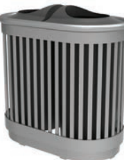
MRC252 SERIES STEEL FLAT BAR 2 X 20 GALLONS LINER: HEAVY DUTY PLASTIC LID: BLACK MOLDED ABS