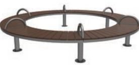
OGM1900-00042 ENDS: STEEL SEAT: IPE, HDPE PLASTIC OR HDPC

Ogden offers flexible curved or circular bench options to configure a style that you visualize. Available in a variety of radii, various seat material and leg options for you to design your individual creation.