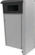
SCWR1600 SERIES FORMED STEEL FRAME, CAST ALUMINUM SUPPORT 32 GALLON LINER: HEAVY DUTY PLASTIC LID: MOLDED PLASTIC