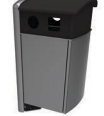
SCRC1602 SERIES FORMED STEEL FRAME, CAST ALUMINUM SUPPORT 2 X 16 GALLONS LINER: HEAVY DUTY PLASTIC LID: MOLDED PLASTIC