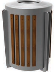
MLWR700-32 SERIES LASER CUT SHEET METAL FRAME AND ALUMINUM CASTINGS 32 GALLON LINER: HEAVY DUTY PLASTIC LID: SPUN METAL

OPTIONS: LASER DESIGN, LINER COLOR (BLUE, BLACK OR GREEN), LABELS