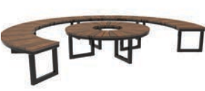
OGM1900-00021 ENDS: STEEL SEAT: IPE, HDPE PLASTIC OR HDPC

OPTIONS: VARIOUS RADII, MOUNTING, ARMS, SKATE DETERRENTS