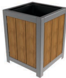
MLP1050 SERIES FORMED STEEL FRAME, IPE, HDPE PLASTIC OR HDPC SIDES LINER: GALVANIZED STEEL