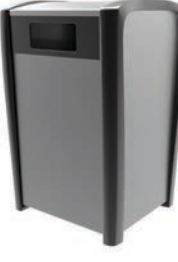
MLWR1400-32 SERIES CAST ALUMINUM FRAME, STEEL, HDPE PLASTIC OR HDPC PANELS 32 GALLON LINER: HEAVY DUTY PLASTIC LID: STAINLESS STEEL

OPTIONS: FACE PLATE COLOR (GREEN OR BLACK), VINYL GRAPHICS, LABELS