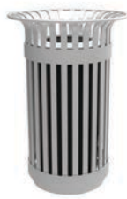
MLWR200-20 SERIES STEEL FLAT BAR 20 GALLON LINER: HEAVY DUTY PLASTIC LID: SPUN METAL

OPTIONS: SIDE OPENING, DOME LID, SIDE ASH RECEPTACLE