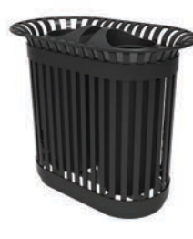
MRC202 SERIES STEEL FLAT BAR 2 X 20 GALLONS LINER: HEAVY DUTY PLASTIC LID: BLACK MOLDED ABS

OPTIONS: VINYL GRAPHICS, LABELS, LID COLORS