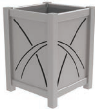
MLP400 SERIES H.S. STEEL TUBE FRAME, IPE, LASERED STEEL PANELS, HDPE PLASTIC OR HDPC SIDES LINER: GALVANIZED STEEL OPTIONS: LASER DESIGN