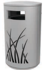
MLWR650-32 SERIES LASER CUT SHEET METAL 32 GALLON LINER: HEAVY DUTY PLASTIC LID: SPUN METAL

OPTIONS: LASER DESIGN, LINER COLOR (BLUE, BLACK OR GREEN), LABELS