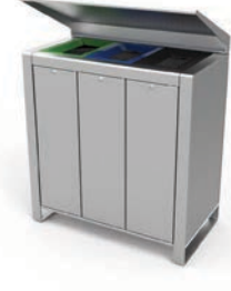
LXRC1503-48-RS SERIES STEEL FRAME, LASER CUT AND FORMED STEEL PANELS 3 X 16 GALLONS LINER: HEAVY DUTY PLASTIC LID: METAL

OPTIONS: RAIN SHIELD, VINYL GRAPHICS, LABELS, LID COLORS