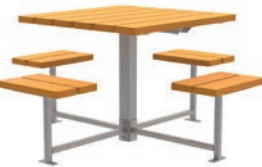
MLPT400 SERIES FRAME: H.S. STEEL TUBE AND FLAT BAR TABLE TOP & SEATS: IPE, METAL OR HDPE PLASTIC

OPTIONS: SURFACE MOUNT, DIRECT BURIAL, WHEELCHAIR ACCESSIBILITY, GAME BOARD