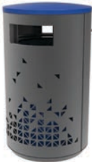
MLWR650-32 SERIES LASER CUT SHEET METAL 32 GALLON LINER: HEAVY DUTY PLASTIC LID: SPUN METAL

OPTIONS: LASER DESIGN, LINER COLOR (BLUE, BLACK OR GREEN), LABELS