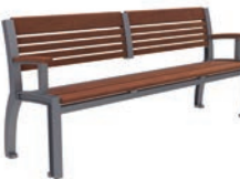
MLB700 SERIES ENDS: CAST ALUMINUM, H.S. STEEL SUPPORT BARS SEAT: IPE

OPTIONS: SIDE ARMS, PLAQUE, SKATE DETERRENT