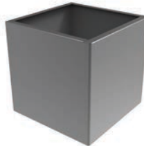
MLP1500-MPS-S1 SERIES FORMED STEEL LINER: POLYURETHANE WATERPROOF COATING